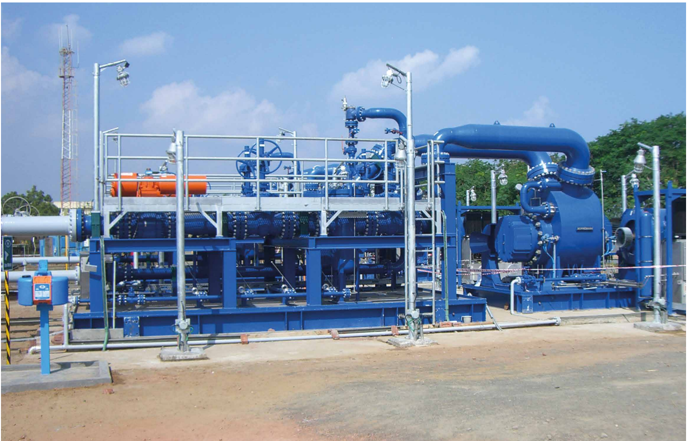
Onshore Terminal in India

Product quality, reliability and competent services are the decisive factors for customer satisfaction. From the very beginning of the installation, Bornemann Pumps and Systems are accompanied by capable services. ITT Bornemann's Service Team provides individually tailored consultation, documentation, delivery of spare parts, maintenance, repair, retooling, exchange, general overhaul, and more. Wherever in the world Bornemann Pumps and Systems are in use, Bornemann services are available.