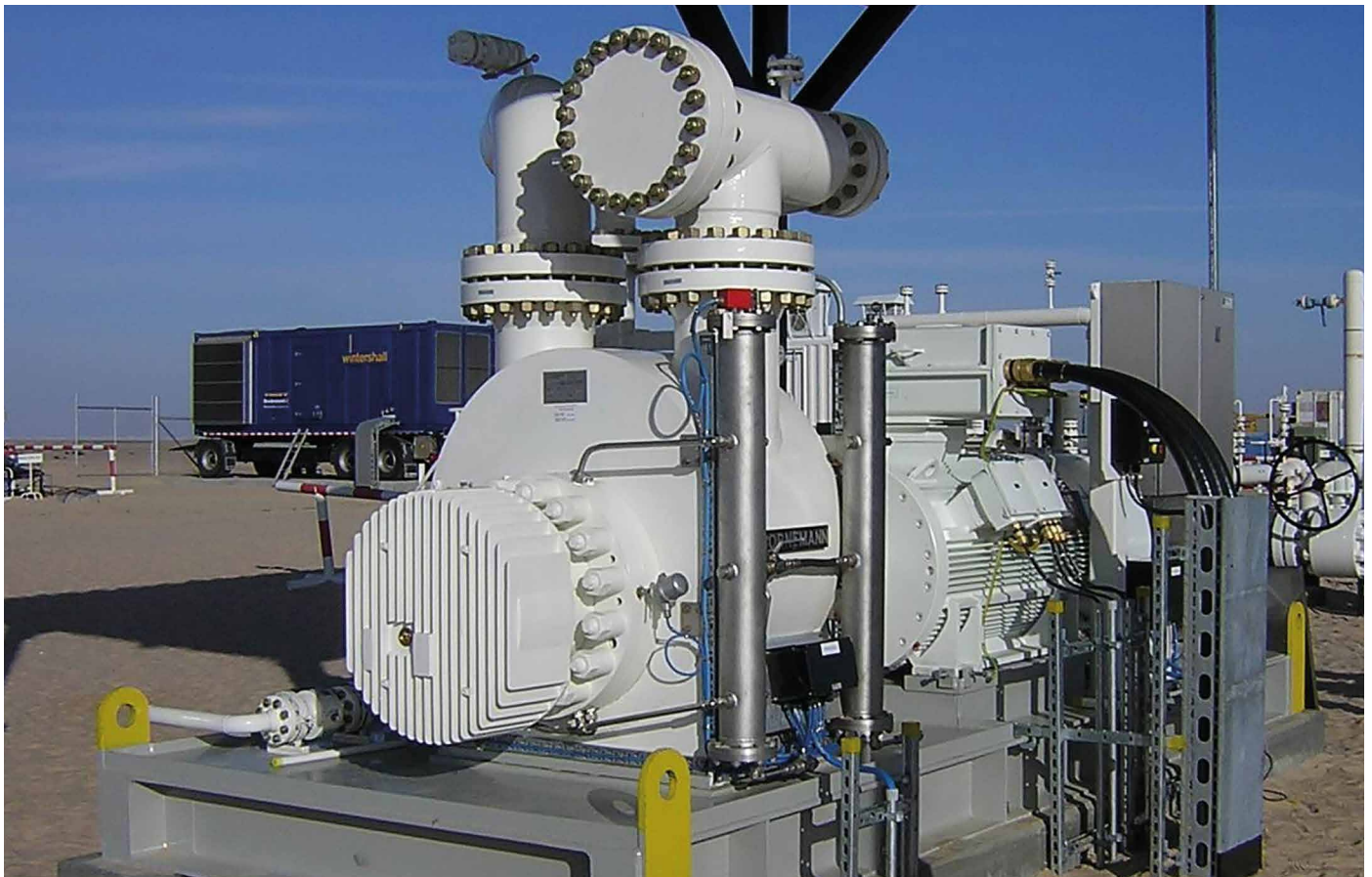
Multiphase „Boosting in Libya“